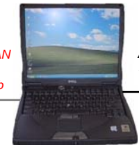
Antenna M&C To Com 1

Your Computer with LAN Card OR Your Network Hub