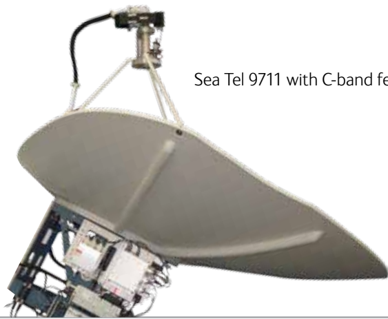
Sea Tel 9711 with C-band feed.