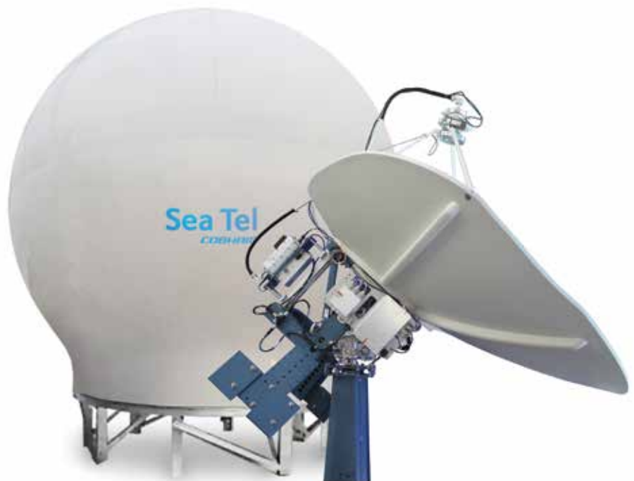
Sea Tel 9711 with Ku-band feed.